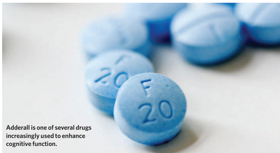
Adderall is one of several drugs increasingly used to enhance cognitive function.

Many of the medications used to treat psychiatric and neurological conditions also improve the performance of the healthy. The drugs most commonly used for cognitive enhancement at present are stimulants, namely Ritalin (methylphenidate) and Adderall (mixed amphetamine salts), and are prescribed mainly for the treatment of attention deficit hyperactivity disorder (ADHD). Because of their effects on the catecholamine system, these drugs increase executive functions in patients and most healthy normal people, improving their abilities to focus their attention, manipulate information in working memory and flexibly control their responses 3 . These drugs are widely used therapeutically. With rates of ADHD in the range of 4–7% among US college students using DSM criteria 4 , and stimulant medication the standard therapy, there are plenty of these drugs on