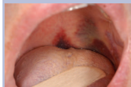
Figs 1–3 Bruising and oedema of three patients who presented with hypochlorite extrusion into the soft tissues

thumb to depress the plunger. 30 This will reduce the risk to periapical tissues by inadvertent extrusion of irrigant.