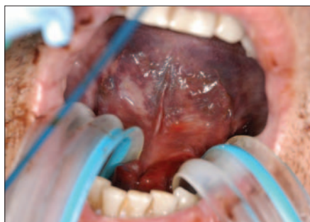
Fig. 4 Upper airway compromise requiring decompression following extrusion of hypochlorite into the soft tissues